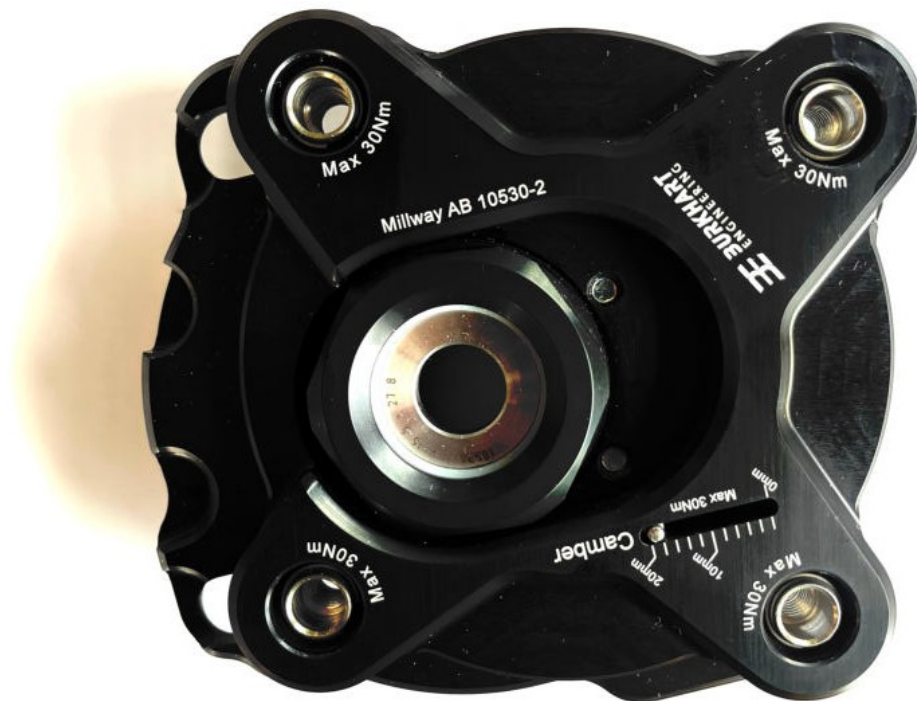
Adjustable strut bearings (Street): 5513G

Errors and changes excepted. Current installation instructions for the respective product can also be found at www.burkhart-engineering.com .