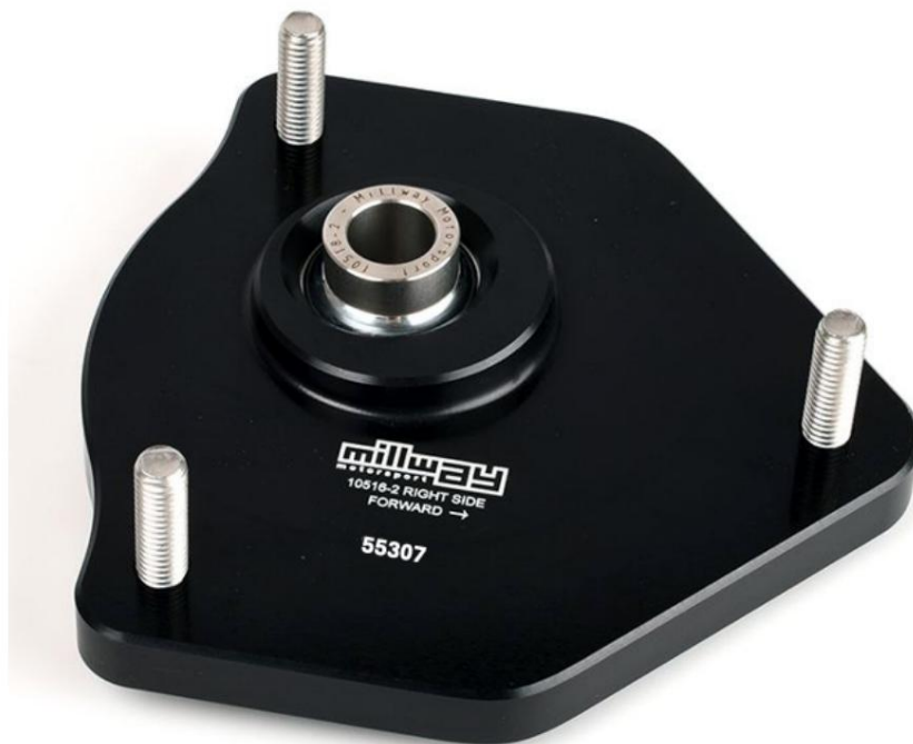
Domlager (Uniball): 55307

Errors and changes excepted. Current installation instructions for the respective product are also at www.burkhart-engineering.com to find.