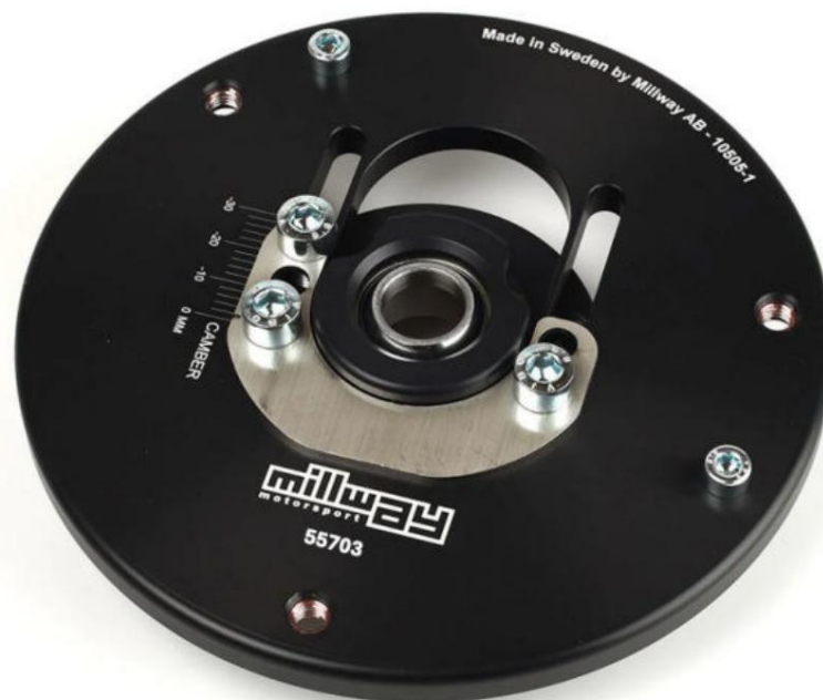
Adjustable strut bearings (uniball): 55703

Errors and changes excepted. Current installation instructions for the respective product are also at www.burkhart-engineering.com to find.